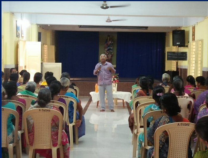
Awareness on the role of women in the Social Transformation