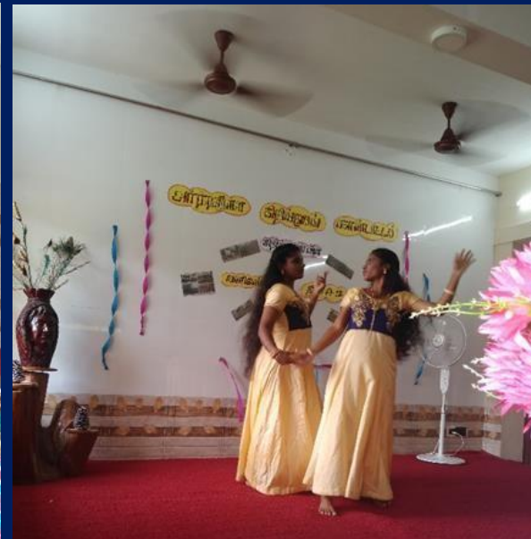
Christmas Celebration in ASSIST