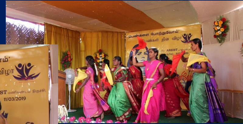
Celebration of Women's Day on March 11 th 2019 @ ASSIST, Trichy