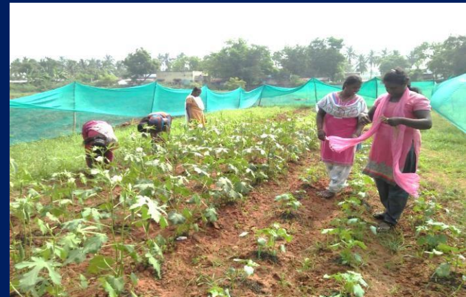
ASSIST's engagement in Environmental care