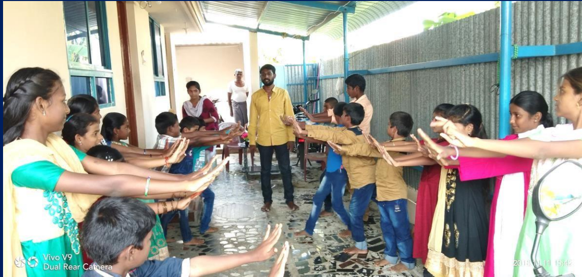
NCP Formation Training

12. Photo show (present some good photos compilation)