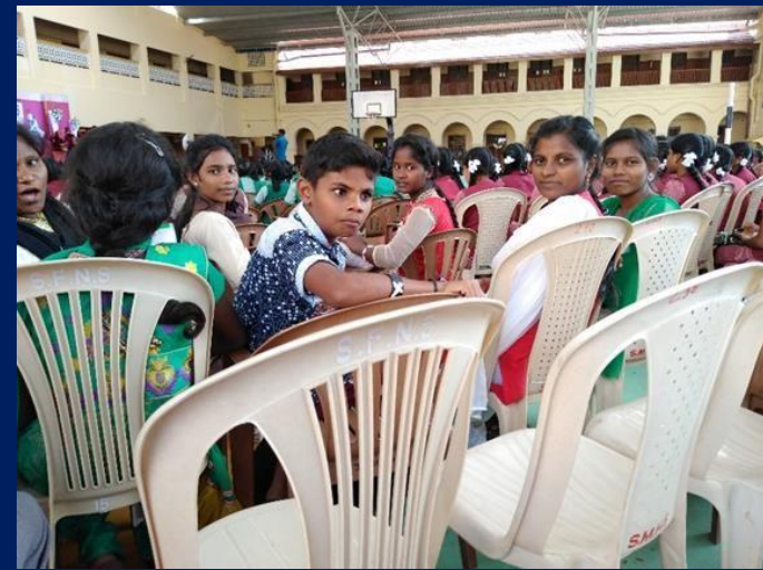
Representatives of Evening study centres and children at risk participated in the first Peace Convention held in Coimbatore on 12 th October 2018