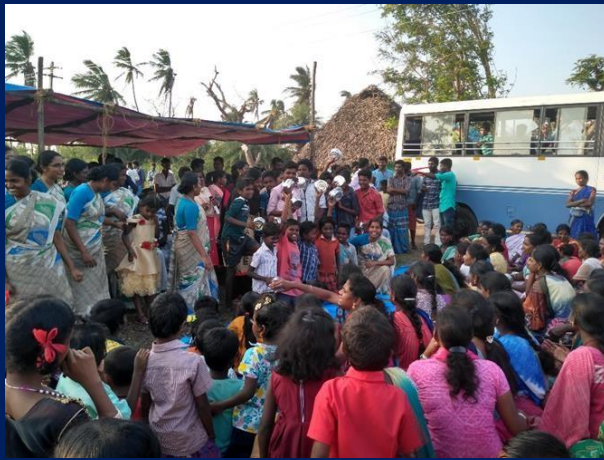
Christmas Celebration with the people affected by cyclone Gaja