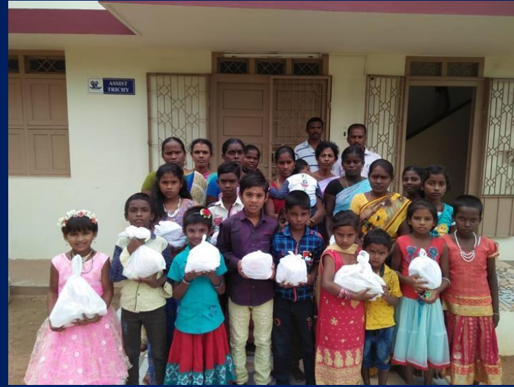
Nutrition distribution and parents meet