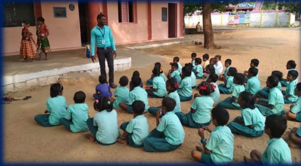
Training in human rights for children and youth