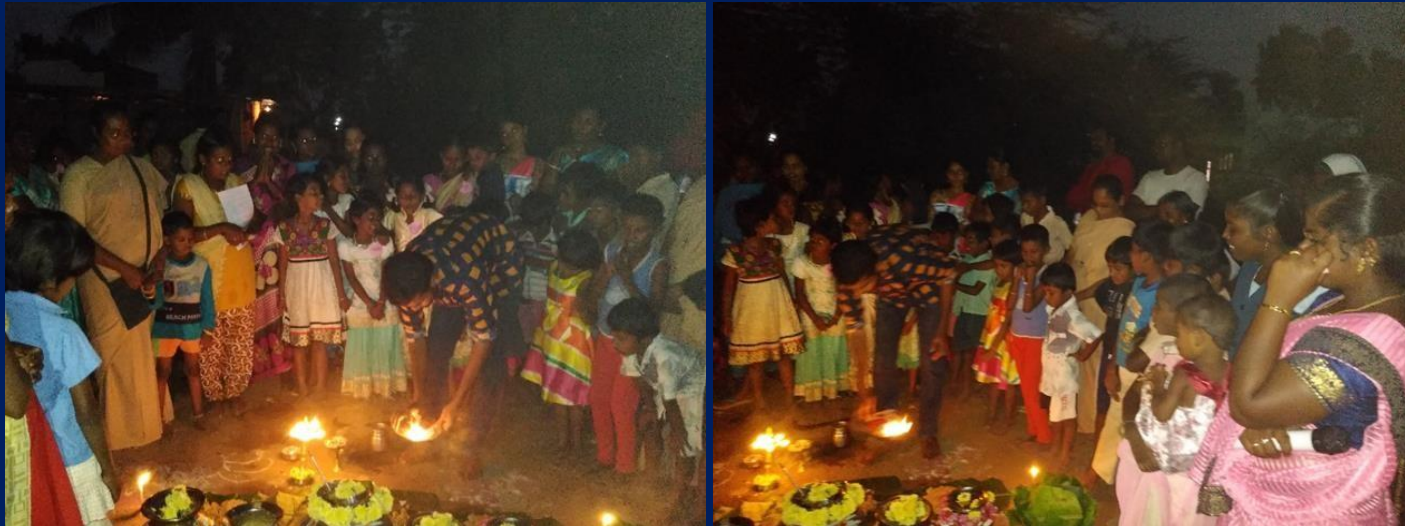
Pongal celebration with the women and children @ Ambhedkarnagar

10. What would be three important success in your ministry that you would like to highlight this year? (Field, province governance, support from sisters etc)